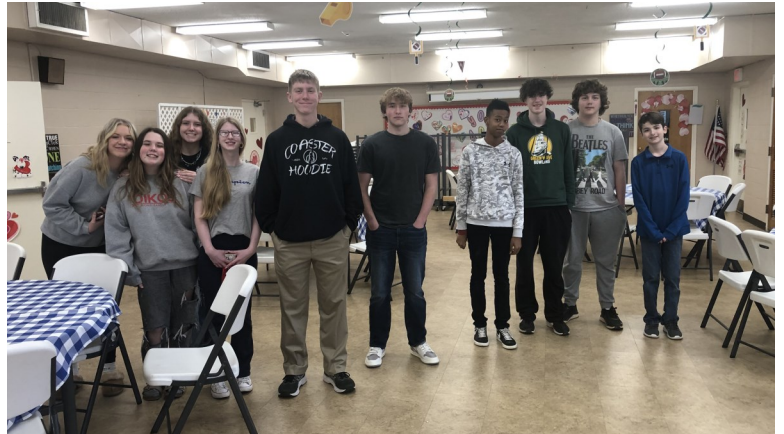
Our Hosts for the Souper Bowl of Caring, Our Amazing Youth Group