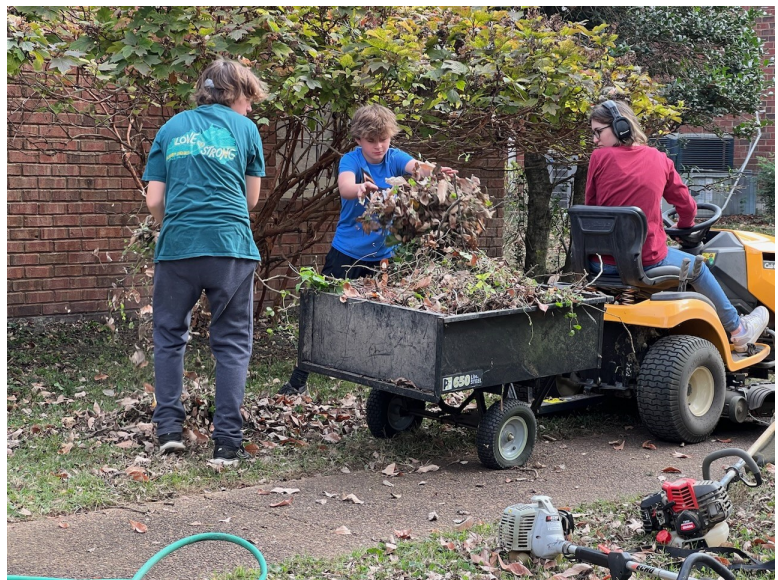
Work Day Photos – On Saturday, October 28, nineteen of us worked at five different member’s homes. We trimmed hedges and trees, pulled out dead hedges, weeded flower beds, trimmed iris’, trimmed sidewalks and driveways with weed eaters, and raked leaves.