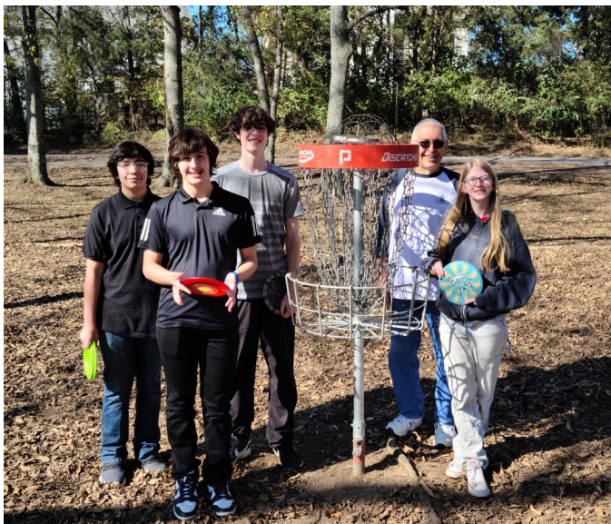
Once again the Youth attempted to golf under par; that is Frisbee golf.