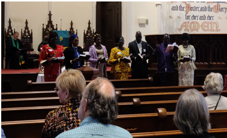
The Sudanese Choir from Gallatin singing at the Presbytery Meeting