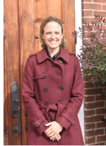
Discipleship & Education