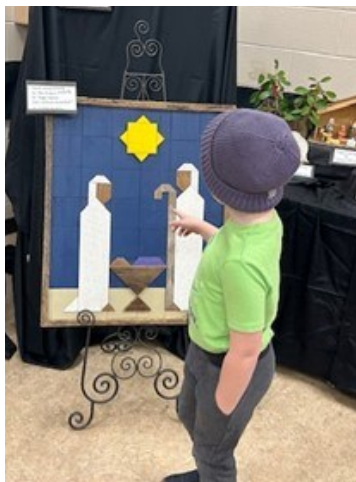
Dayschool kids looking at the Nativity scenes