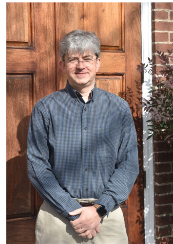
Clerk of Session