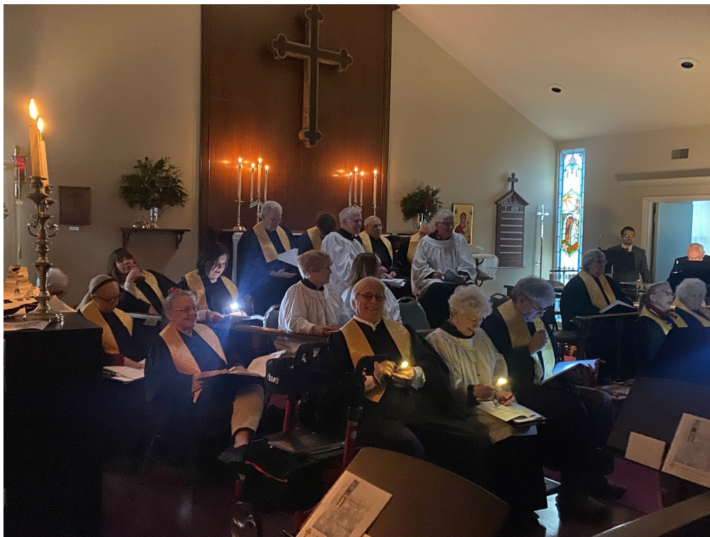
The Show Must Go On! —The Joint Choirs from St. Joseph of Arimathea and First Presbyterian Church performed Lessons & Carols with no light or heat, only candlelight and flashlights. What a show!